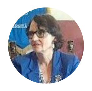
THE GLOBAL WATER CRISIS AND THE FUTURE OF FOOD

Associate Professor | Planetary Health and Nutritional Epidemiology, London School of Hygiene and Tropical Medicine